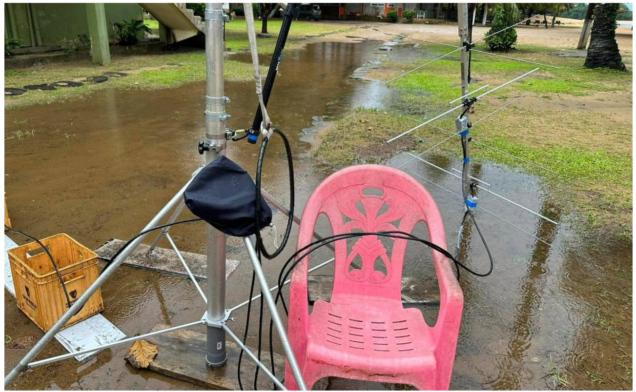
At times the activity suffered from storm and torrential rain.