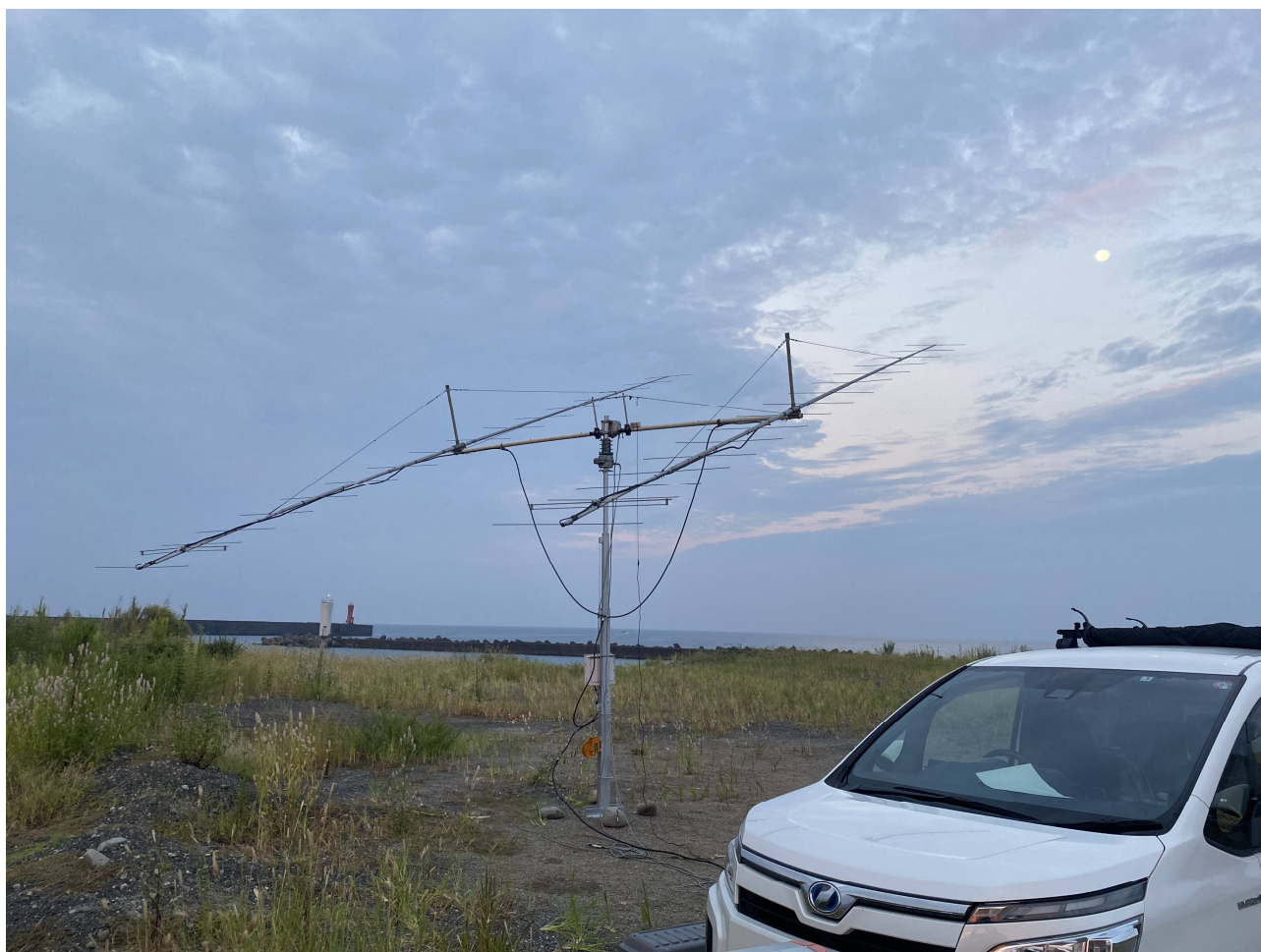
Another view to the antennas in PM73AK, also with Hide's shack in the car...

From PM73AD he logged 15 complete QSOs in three hours on September 29 th and 7 more QSOs on September 30 th during only two hours.