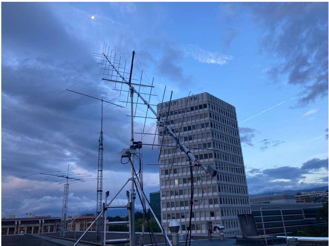
Different perspective: The 16/16 ele xpol focussing on the moon.

Together with station keepers Nick SV3SJ and Attila OM1AM they set up a single 13/13-ele-xpol yagi (14,5 dBd) on the roof of the ITU building and assembled the 2 m EME station (FT857 + SSPA) in the ITU shack. Everything worked without a problem – until Chris switched on his main Dell i7 laptop. It decided to run a Windows 10 update and after restart it did not work properly anymore since it apparently had lost some configuration data. Consequently they had to swap it for the back-up laptop which ran only on Windows 7 and lacked the computing power for Q65. Therefore JT65B was chosen instead.