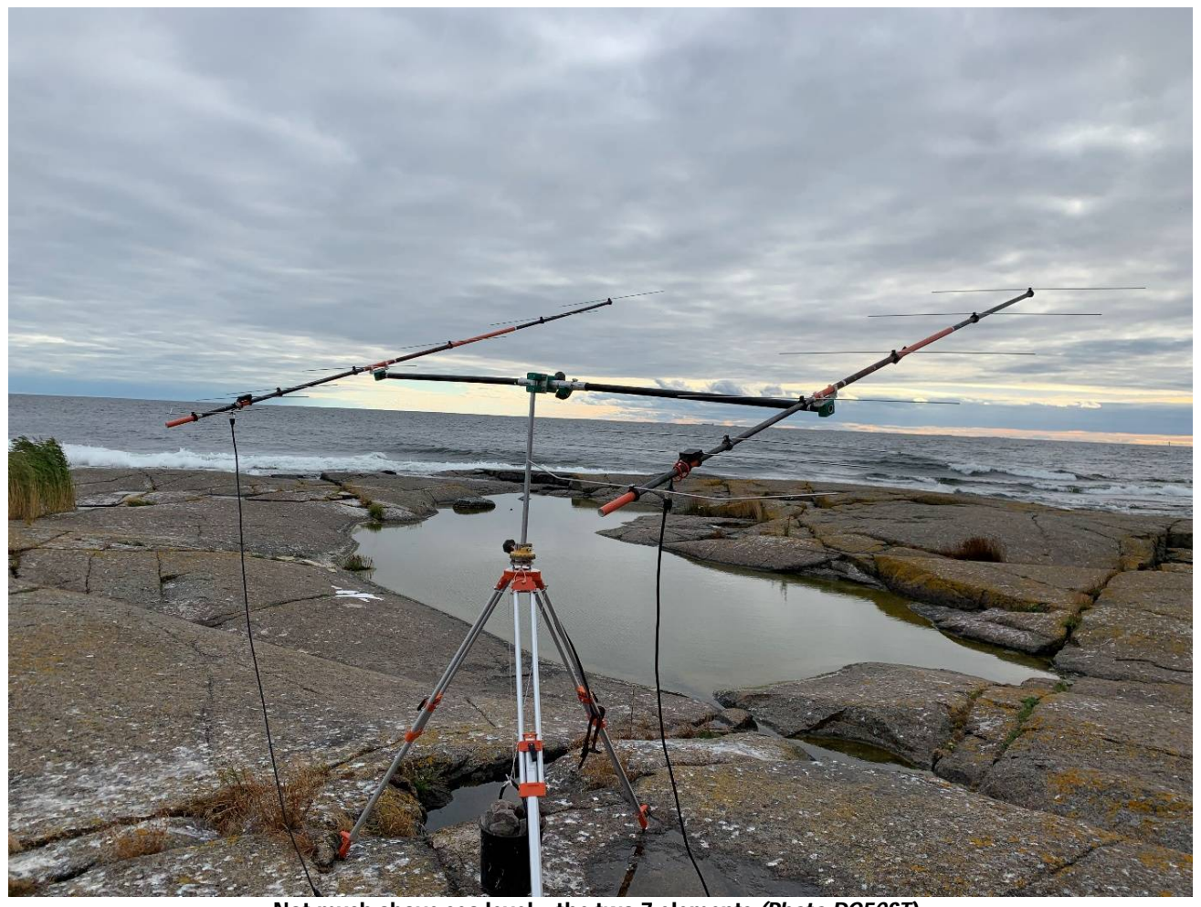
Not much above sea level - the two 7 elements

Around 60° Northern Latitude, there are two small DXCC entities in the Baltic Sea located between Sweden and Finland: OHO, the Aland Islands, and OJO, Market Reef (JP90NH). The latter belongs partly to Sweden, partly to Finland and the finish part counts as a separate DXCC. The rock is just roughly 30000 m² and incorporates nothing but a light fire, a weather station and navigational transmitters. Being just max 2 m above sea level and without any port, landing on Market is always a challenge, depending on sea conditions and wave heights. Sometimes high waves would even spill