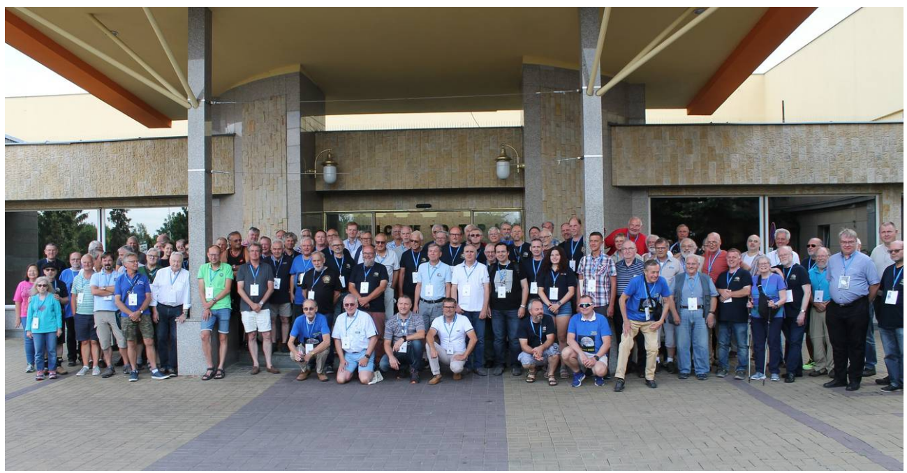
The obligatory group photo at EME 2020 in August 2022

From August 12<sup>th</sup> to 14<sup>rd</sup> the 19<sup>th</sup> International EME Conference took place in Prague. Due to COVID it had to be postponed twice from 2020 to 2021 and then 2022. 136 EME hams congregated in the Top Hotel Praha. If you search "EME Conference" on youtube you can find some videos from the conference. It was also decided that the next EME conference will take place in the USA – in Trenton, NJ.