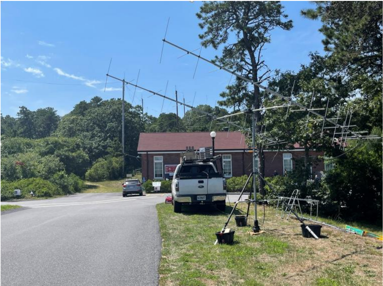
KA6U Working from the Marconi Maritime Center in FN51AV