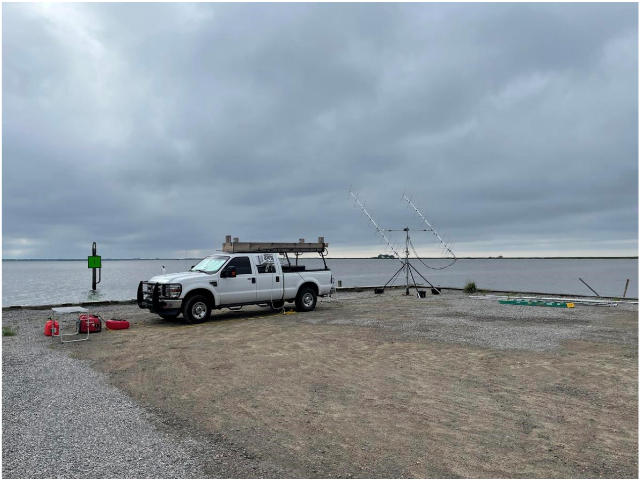
KA6U portable QTH in FM26BG on 10 July 2021