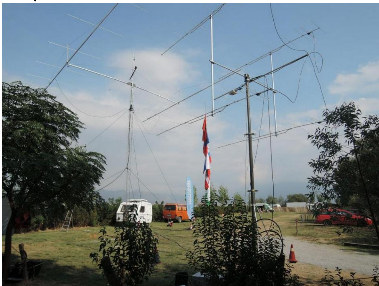
The two 6 m yagis and the 2m array at lake Shkodra resort.

From October 1 st to 6 th a mixed team from Austria and Slovenia – members of the OE6V contest team (OE6FNG, OE6TQG, OE6YWD, OE6JUE, OE6WIG, OE6VCG, OE6KAE), of the Albanian Shkodra radio club ZA5V and of the national association of Albanian radioamateurs and S59A – were QRV from Albania. Their focus was on HF as well as on EME on 6m and 2m. On 144 MHz the set-up consisted of Elecraft K3, Kuhne TR144-H transverter, BEKO HLV-2000 sspa, WA2ODO Ina and a group of four 9 ele yagis DK7ZB design.