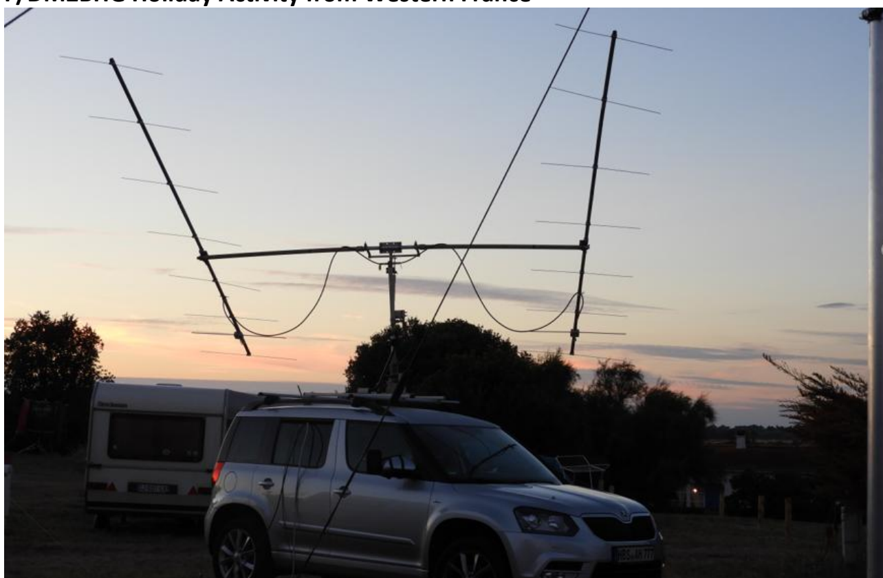
DM2BHG's special construction to mount antennas on the roof of his Skoda Yeti