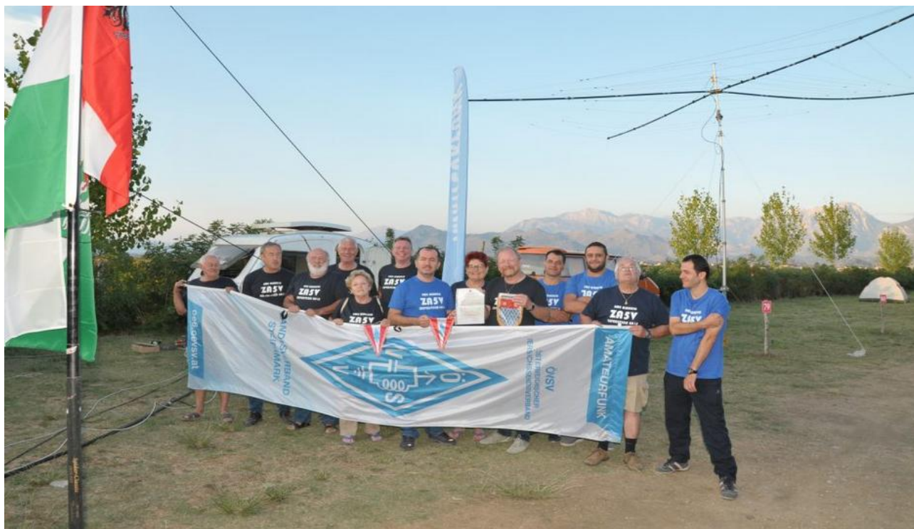
The entire Albanian/Austrian/Slovenian team