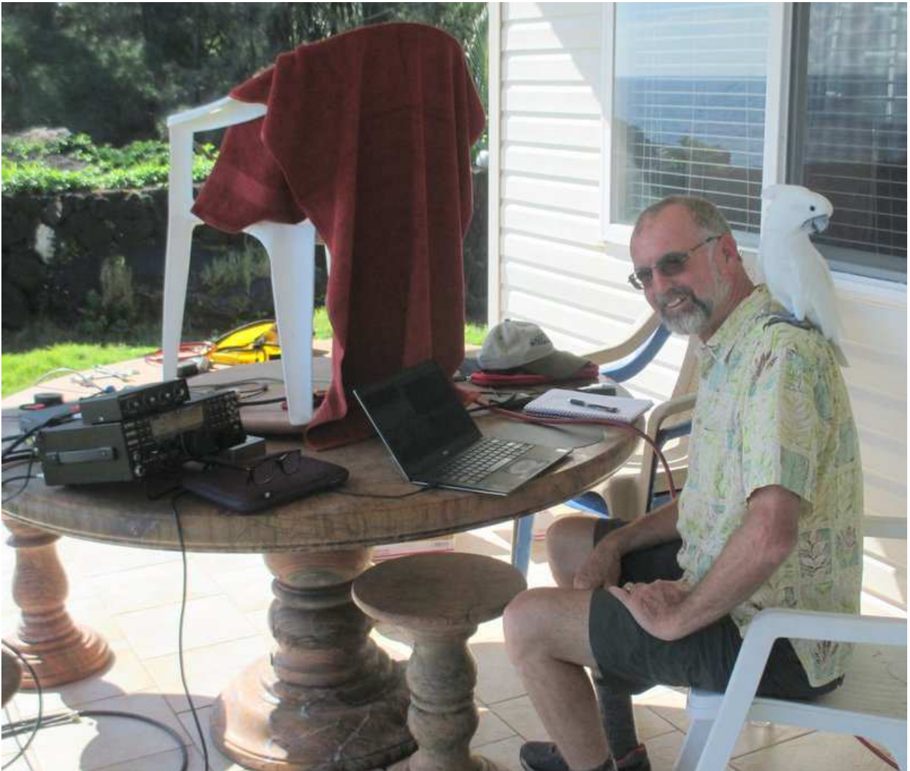
Gene in the outdoor shack with a local visitor (KH6LC's pet)

From his observations Gene guesses that his 2 meters signal was down by just 2 db compared to the 2 x 9 element yagis he uses back home. He had also substituted the LMR400 feed line coax for LMR600 because of weight considerations.