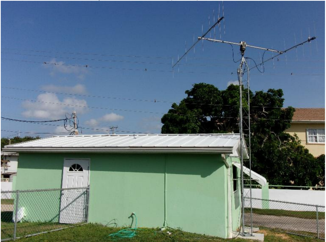
The ZF2EM QTH, located in the ZF1A shack on the property of Andrew ZF1EJ

N8PR and N5ZN QRV from Cayman Islands: ZF2EM (EK99IG)