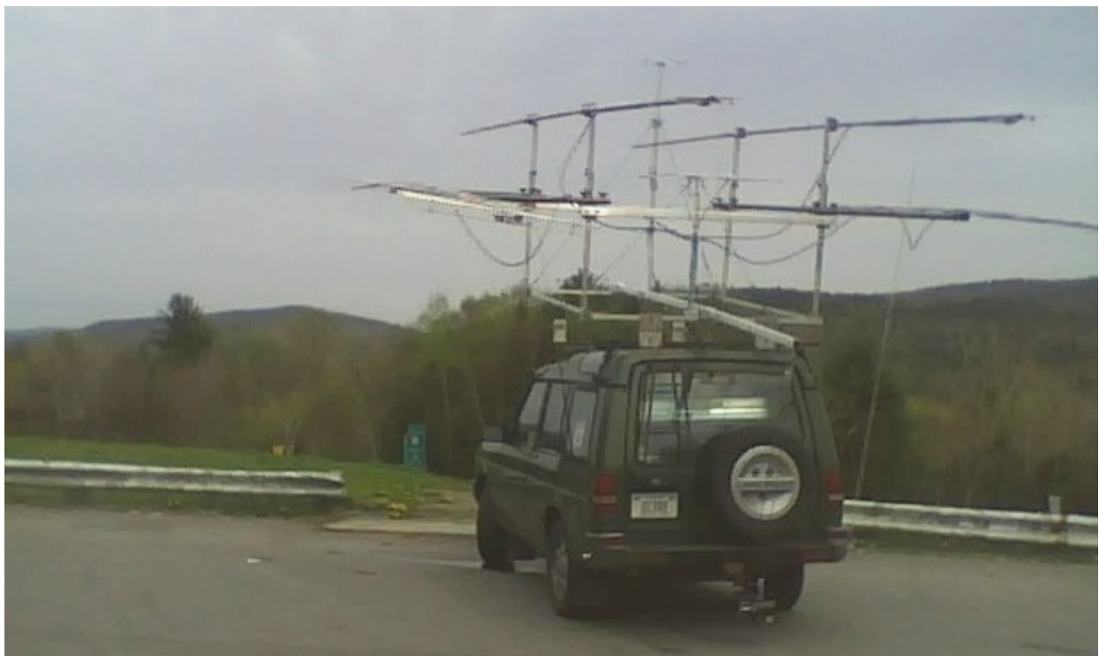
W1H mobile EME radio station contacting Switzerland from New England.

Therefore, it seemed appropriate today, in 2009, to initiate a ceremonial two-way radio contact using the moon to reflect the radio signals between the Alan Hovhaness Memorial Station W1H and station HB9Q in Switzerland. The successful two-way transmissions took place on 3 May, 2009. A second successful EME (Earth-Moon-Earth) contact from W1H took place shortly thereafter with station LA8YB in Norway. Martin, KC3RE